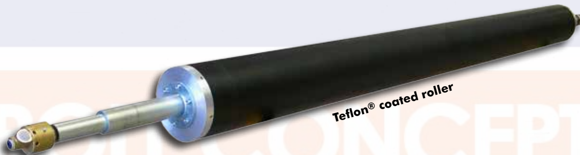
Teflon® coated roller

Non contractual pictures and datas - Last update : May 2013